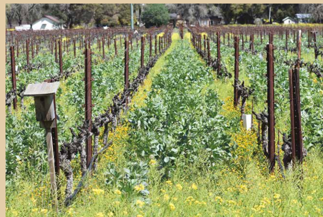
A healthy cover crop